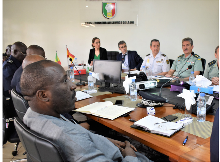
CT Public Spaces team in meetings with relevant Senegalese institutions, such as the Senegalese National Police (PNS)