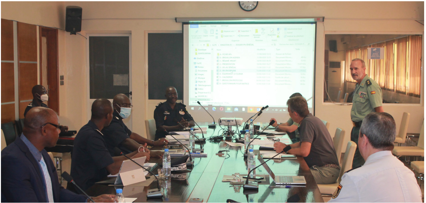
One of the technical meetings held in Dakar with Senegalese authorities in September 2020