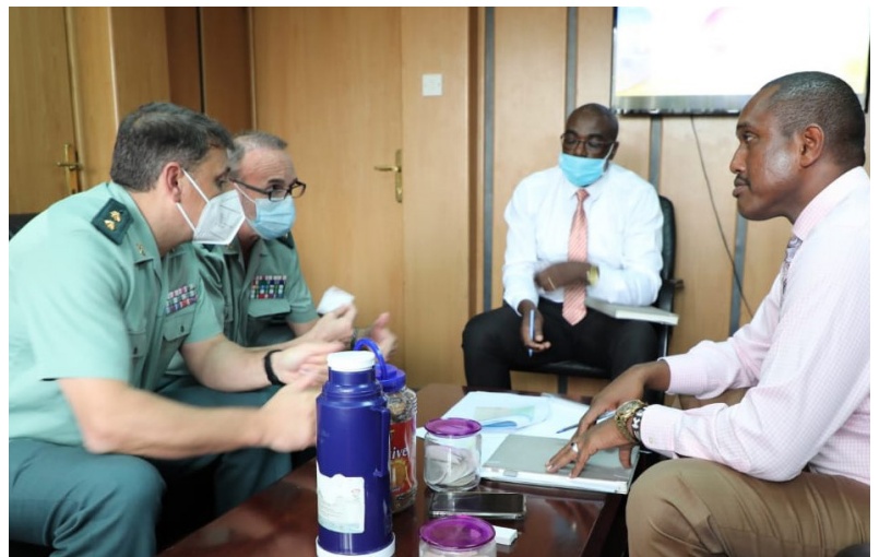
CT Public Spaces Specialists from the Spanish Guardia Civil in meetings with potential Kenyan partners

Two experts from the Spanish Guardia Civil had the opportunity to meet with representatives from the Kenyan National Police Service (NPS), the Administration's Police Service (APS) and the National Counter-Terrorism Center (NCTC) in order to introduce the project and lay the foundations for working together in the future.