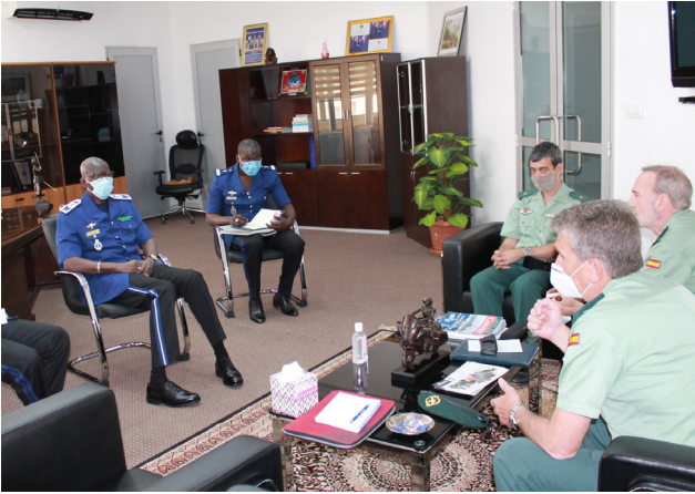
Guardia Civil specialists meet with the Deputy Chief of the Senegalese National Gendarmerie.

where the training will take place and review the profile of students, stressing the importance of the participation of women in the project's initiatives. Thus, agreements have been reached for the development of 5 training courses in Logroño, in the months of May and June, in the areas of command and control, tactical patrol, risk analysis, drones and counter-drones. In Dakar, work will focus on capacity building for precision snipers, intervention dog handlers and explosives detection dog handlers.