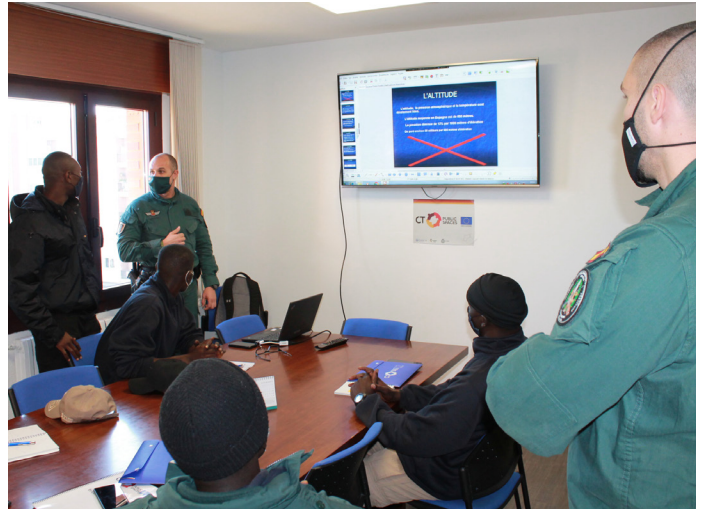
Theoric sessions during the training in precision snipers carried out by the Spanish Guardia Civil.

In November 2020, we interviewed 4 representatives of the Senegalese police and national gendarmerie, to learn first-hand about the content and impact of the training courses that were carried out at the Guardia Civil's Special Forces Experiences Complex (PEFE) in Logroño. This first experience resulted in a team of trainers who, upon their return to Dakar, passed on what they have learned with the support of project specialists.