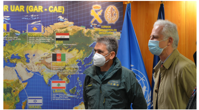
A moment from the visit to the facilities of the Guardia Civil

of specialised training. Its location in Logroño makes the city the ideal place to host the development of a large number of activities of the CT Public Spaces project. In November 2020, a dozen members of the Senegalese Gendarmerie and National Police went there to attend tactical training for precision snipers, intervention dog handlers and explosive detection handlers.