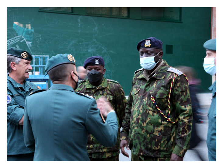
Training in Logroño carried out by the Spanish Guardia Civil.

Through these trainings, a nucleus of experts in public space protection is being created at the heart of the security forces in the partner countries. These experts replicate the trainings in their countries, making the project sustainable over time.