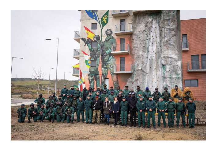
CT Public Spaces' launch event on November 24th and 25th, in Madrid and Logroño (Spain).

To officially present the CT Public Spaces project and to raise awareness in the protection of public spaces among partner countries—authorities, a launch event was organized and held in Madrid (Spain) on the 24th of November 2021, where the project was formally presented in the General Directorate of the Guardia Civil.