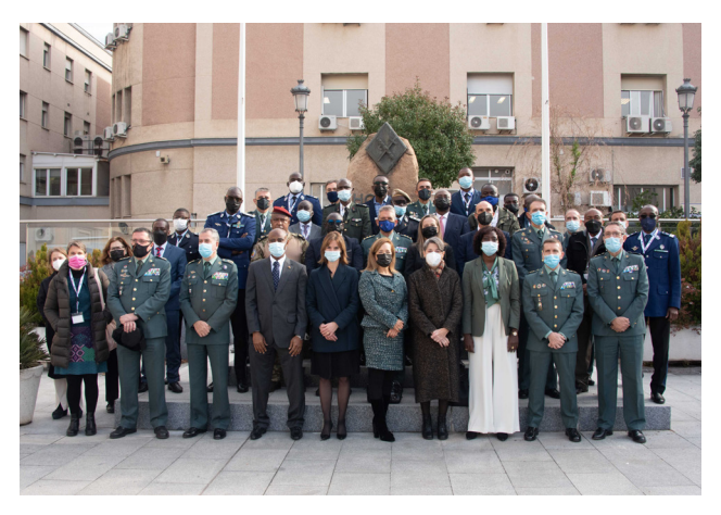
Closing the official launch of the project in Logroño.

Furthermore, taking advantage of the presence of many relevant authorities from the partner countries in the event, a visit was organized to the Guardia Civil unit which is implementing most activities of the Project, in coordination with the EUHRSN, in Logroño (Spain). This visit took place on November 25th, 2021, with representatives from the delegations of the European Union, Ghana, Kenya and Senegal.